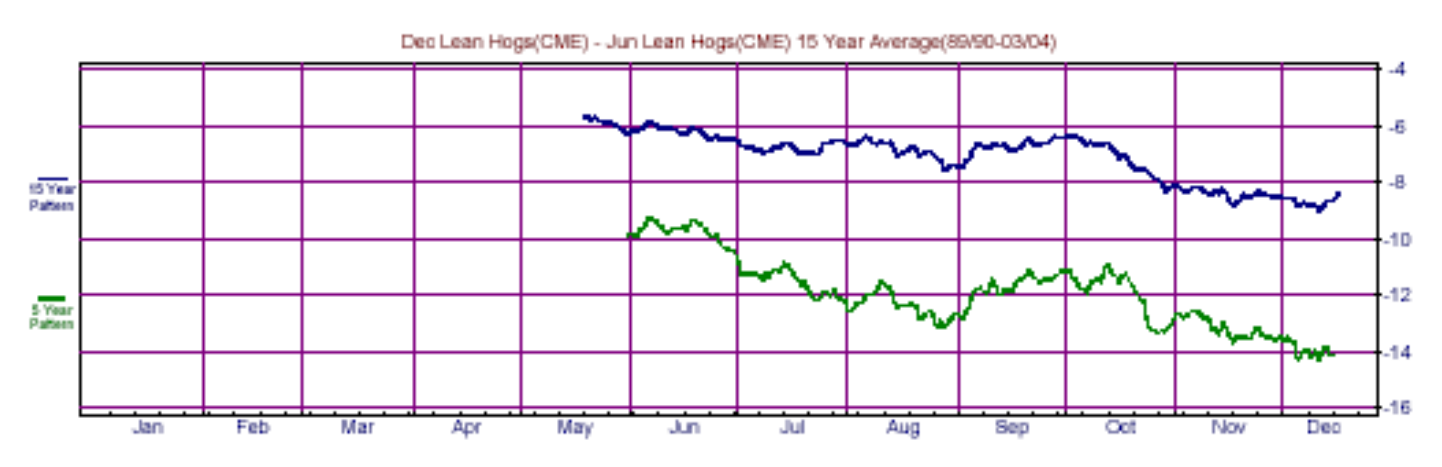
Historical Seasonal Data